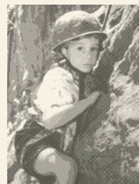
Already an Overachiever

and clear. “When you work hard writing something even as simple as a short article, and you pour yourself and your style into a piece, it is one of the best feelings in the world to know that someone might be reading it.” And style he has. Even at 16-